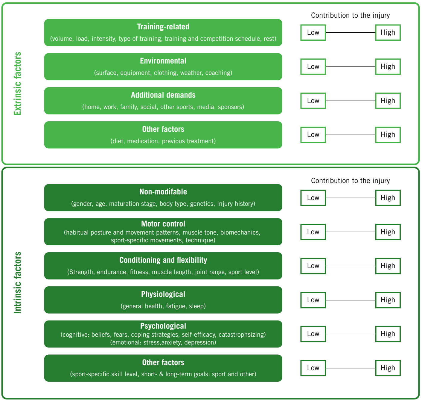
Figure 1: Factors influencing low back pain in athletes. Both intrinsic and extrinsic factors can contribute to the development or persistence of LBP in athletes. 'Contribution to the injury' can be estimated for each factor as a method of determining which factors should addressed in the rehabilitation of each individual athlete.

non-modifiable). These will not be covered in this article, but these factors form an integral component of a comprehensive management plan for each athlete with LBP.